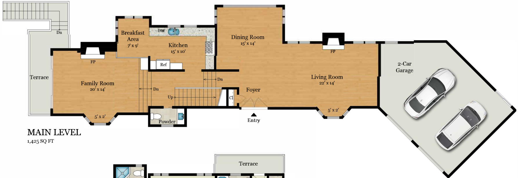
MAIN LEVEL 1,425 SQ FT